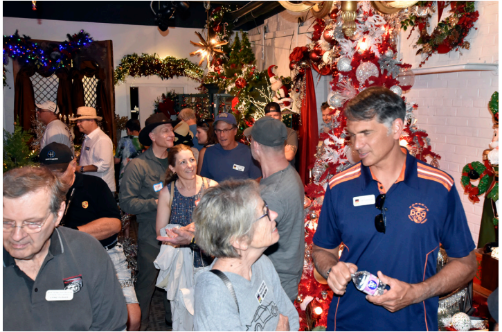
Inside the Christmas Shop

Highlights included a Ford Model TS and Model AS, a '50 Oldsmobile and a '63 split window Corvette. All vehicles were in pristine driving condition with low mileage. But, as our guide pointed out, the neon signs, service station pumps and memorabilia that dressed the "sets" for these vehicles might even be worth more than the cars themselves.