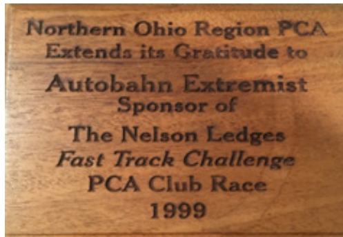
Sponsor appreciation plaque