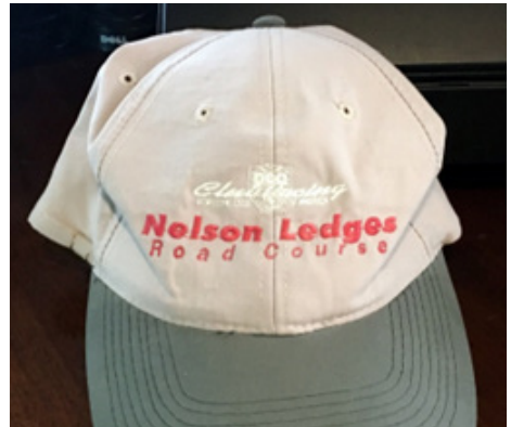
Participant souvenir hat