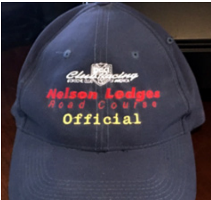
Official's/Volunteer's souvenir hat