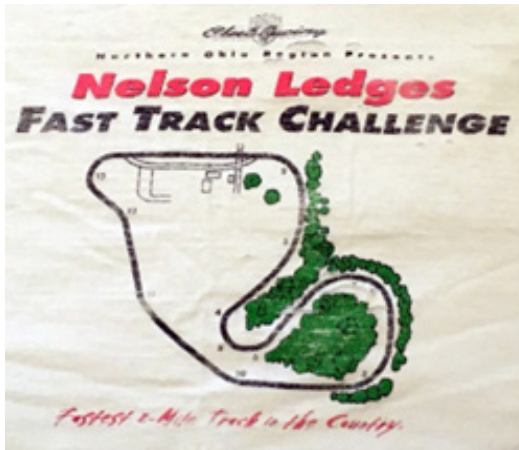
Souvenir T-shirt back