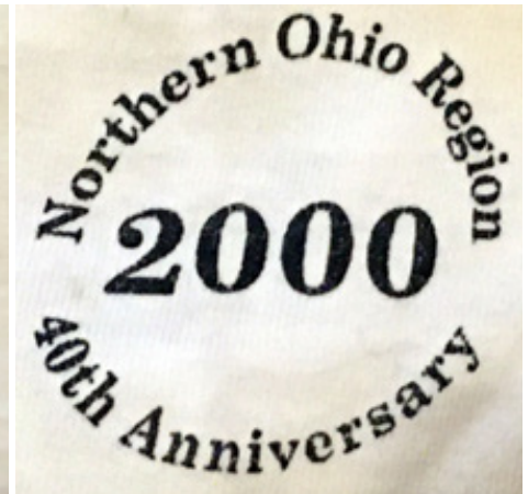
T-shirt sleeve – NOR 40th anniversary