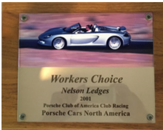
The Workers Choice Award.

NOR supplemented its trophies to podium finishers with a calligraphed certificate created immediately before the trophy presentation ceremony by an NOR volunteer.