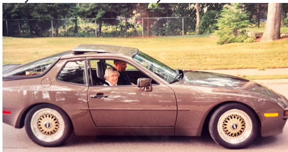
My 84-yr-old aunt was one of the first to take a ride with me