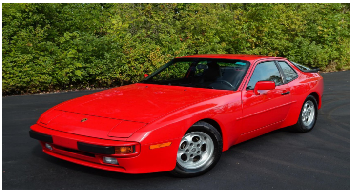
944 stock photo

The day of the party arrived, and my wife and I eagerly headed to Public Square, where a crowd of several hundred people had gathered for the big giveaway. I checked in at the event table, presented my letter, and then drew a key from the basket. After all the keys had been handed out, the festivities began.