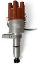
2.7L, 3.0L, Turbo Distributor