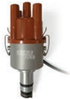
356 & 912 Distributor

See classic Porsches and live demos of our latest restoration kits and performance upgrades for air-cooled engines. Stop by and see what Perma-Tune can do for your Porsche!