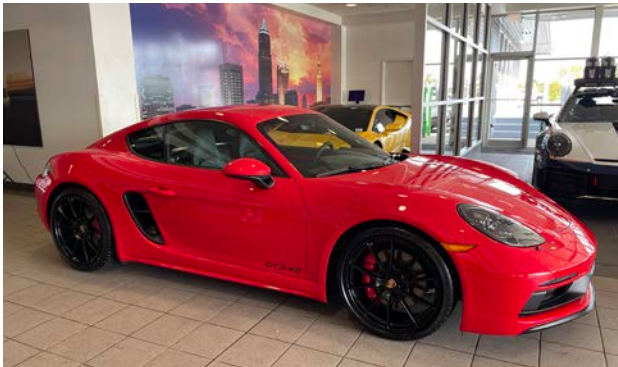
2023 Cayman GTS 4.0