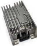
911SC906 6 Pin Ignition Module