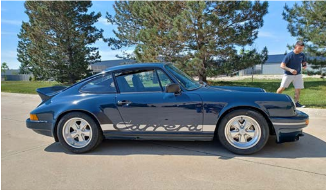
1980 911SC early PTS car Aga Blue